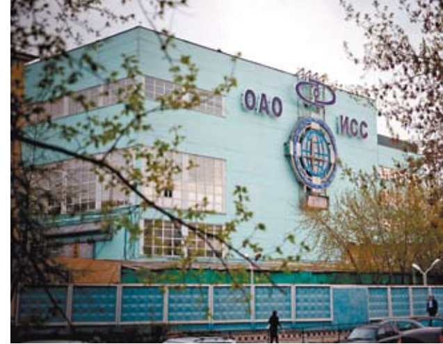
On the face of it: the ISS complex in Zheleznogorsk

The increase in orders has enabled the factory to increase its workforce again. Today, some 8,500 people work at ISS, of whom the majority are young. Newly minted engineers from the